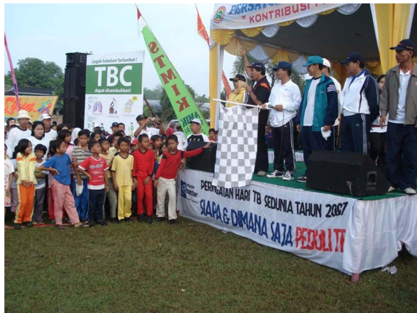
Walkathon to commemorate World TB Day at Asahan District

The World TB Day event in Asahan also received supports from the private sectors such as PT Jamsostek—Kisaran, PT Askes—Tanjung Balai, and PT Bakrie—Kisaran.