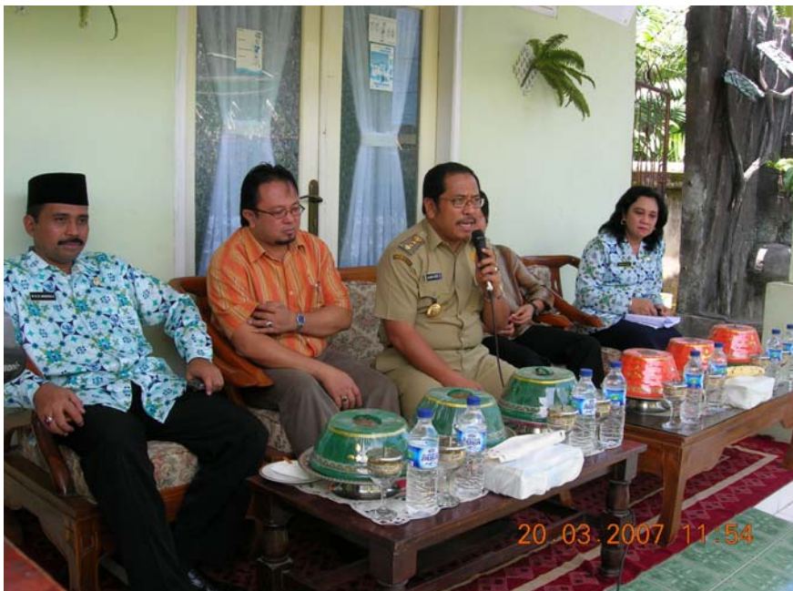
The Mayor of Makassar conducted public dialogue after a site visit with the Head of Municipality, Head of D Commission—Regional House of Representatives, KuIS dan Head of Makassar's Health Office