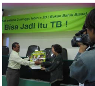
Handover of the TB IEC materials by NTP

Representatives of treatment observers (PMOs) as well as ex-patients were then invited to share their experiences in completing treatment and achieving recovery.