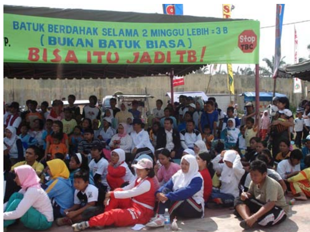
Participants of the Walkathon rested while listening to health education

On March 22, 2007, the Asahan District World TB Day Committee (HTBS) - which included Master Foundation, The National Nurse Association—Asahan Chapter, Family Planning Association (PKBI—Asahan), and Coalition for Asahan Sehat, sought a meeting with Asahan's House of Representatives. As the result of the meeting, Head of D Commission gave support for the implementation of World TB Day activities, as well as gave commitment to allocate TB control funding in the regional budget of Asahan District. For the 2007 budget, the local government of Asahan already allocated 150 million rupiah which was stated in ratified budget.