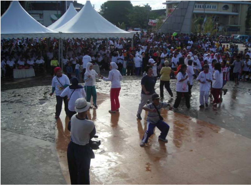
The people of Makassar danced to the music during the TB Music Event at Losari Beach