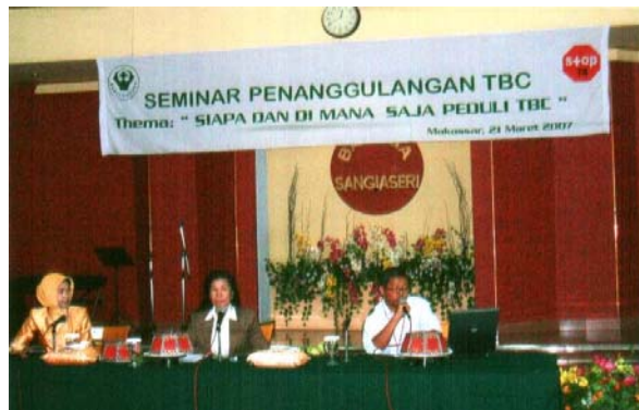
TB Control Seminar

The seminar was a collaboration between Makassar's Environmental Health and Disease Control Center (BTKLPPM), South Sulawesi's Women's Association, South Sulawesi's Women's Group as well as the Faculty of Medicine— Hassanuddin University and was attended by 180 participants from 23 districts/cities in South Sulawesi.