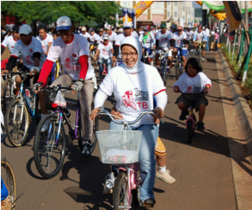
“Bikes Against TB” drew various participants.

In addition to “Bikes Against TB” event, LKC also conducted various trainings for PMOs (treatment observers) as well as workshops on TB. The PMO training was implemented as the start of the chain of events to commemorate World TB Day and was attended by all health cadres in Tangerang and Bekasi (both at the city and district level).