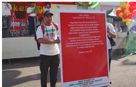
Declaration of the “Care for TB Community”

Participants biked around 20 kilometres in about one hour, starting from Golden Boulevard, Tekno Park and back. In addition to biking, the participants were entertained with drumband, traditional islamic songs, and choir performance from Al Azhar School BSD. The event was supported by private sector partners such as BSD City, Polygon, and other sponsors.