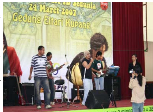
Cendana Band entertained Kupang

Since the audience were very enthusiastic, the event, which was supposed to end at 4 pm, was extended for an hour.