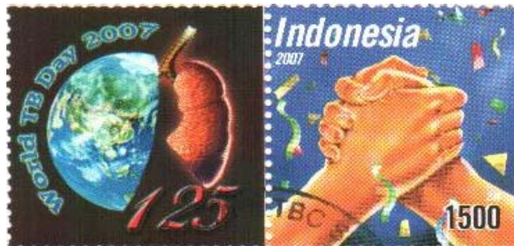
“World TB Day 2007” Stamps

To commemorate World TB Day 2007, two special stamps were launched on the day. Exhibitions by various organizations from many districts in South Sulawesi were also showcased at the event to give the latest information on TB achievements.